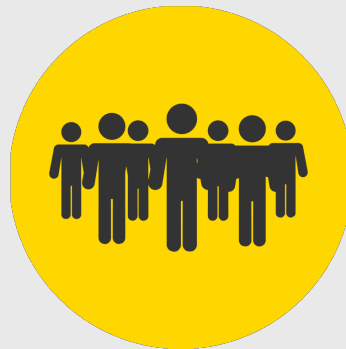
Bulk Overseas Recruitment