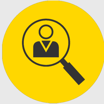
Executive Search & Selection