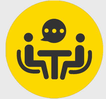
Consulting for recruitment selection and onboarding of workers globally