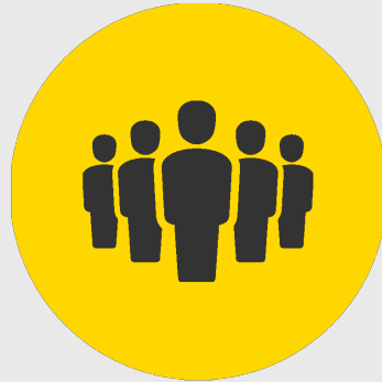
Mid Level Staffing (Permanent & Flexible Solutions)