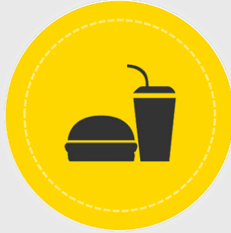
Food & Beverages